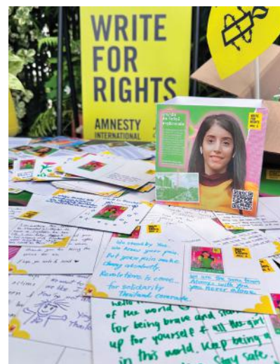
Petitions and postcards in support of Manahel Al-Otaibi during Write for Rights 2024.

ENGAGE emotionally and develop values and personal commitment.