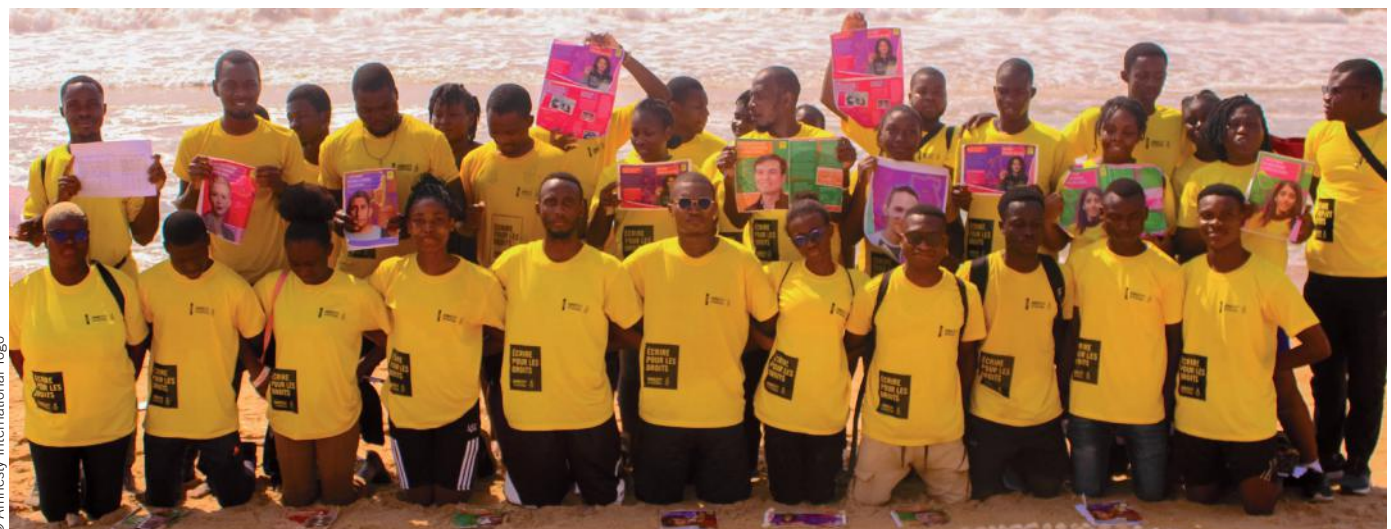
Amnesty activists in Togo during Write for Rights 2024.

human beings. Human rights have become part of international law: since the adoption of the UDHR, numerous other binding laws and agreements have been drawn up on the basis of its principles. These laws and agreements provide the basis for organizations like Amnesty International to demand that governments end the abuses experienced by the individuals featured in our Write for Rights campaign.