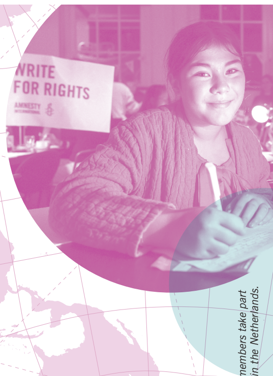
Amnesty supporters and members take part in Write for Rights 2024 in the Netherlands.

AMNESTY INTERNATIONAL IS A GLOBAL MOVEMENT FOR HUMAN RIGHTS. WHEN INJUSTICE HAPPENS TO ONE PERSON, IT MATTERS TO US ALL.